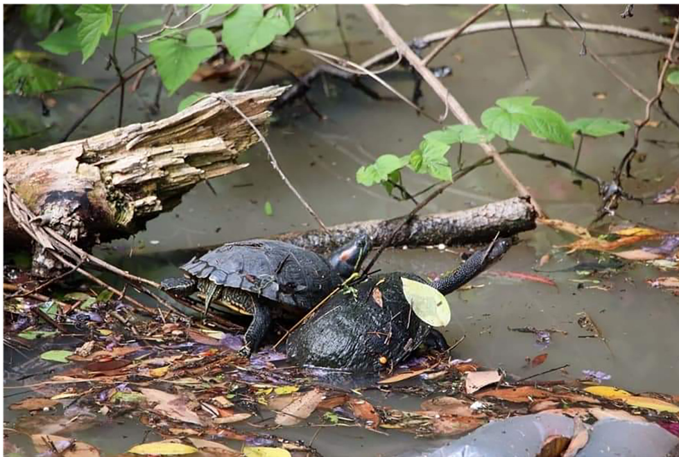
FIGURE 1 An eastern long-neck Turtle, Chelodina longicollis (Right), and a red-eared slider, Trachemys scripta elegans (Left) basking on a log in an urban wetland in Sydney. Invasive turtle species, like the red-eared slider, are not wide-spread in Australia but have the potential become so and to compete for resources and habitat with native species of freshwater turtle.

and disease (Zhang et al., 2018). Overlaid on these pressures is the alteration of environments predicted by climate change (Stanford et al., 2020). Despite Australia's low human population size, Australian freshwater turtles are not quarantined from the impacts that apply globally. We just have a different combination of impacts where they differ in their respective magnitudes. Arguably, because of our rigid controls over wildlife exploitation and trade generally, the current harvest of freshwater turtles for consumption and export is of much lower concern in Australia than elsewhere (Alacs & Georges, 2008) and so is not considered a key threatening process.