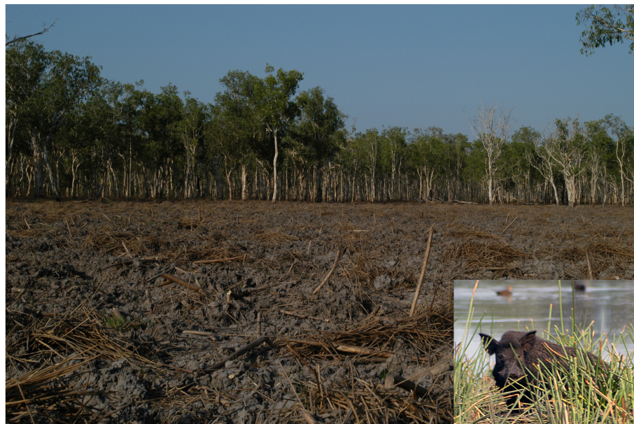
FIGURE 4 Feral pigs have a devastating impact on wetlands in the tropical north of Australia. Shown here is damage to an area typically used by the northern snake-neck turtle Chelodina rugosa for nesting and aestivation during the dry season of the wet-dry tropics. Fencing sensitive wetlands is an option that requires evaluation through research and monitoring. Photo: Damien Fordham, Arnhem Land.

but the offtake is considered to be an order of magnitude lower than losses from feral pig predation (Fordham et al., 2008). The species also exhibits a strong density-dependent response to population reduction (Fordham et al., 2009), has a low age at maturity, and is therefore considered quite resilient to population fluctuations. The species does not appear to have been severely impacted by the cane toad, with reports of it feeding on toads with impunity (Covacevich & Archer, 1975) or potentially causing deaths (Greenlees & Shine, 2011). Priorities for conservation action directed at this species include wetland protection (particularly from the impact of exotic plants and saline incursions in low lying areas) and restoration, using fencing to reduce the impact of feral water buffalo and pigs on sensitive wetlands (Figure 4). The value of the species to Indigenous communities can be enhanced by linking it to opportunities for commercial wildlife harvest (Figure 4, Fordham et al., 2007), a contemporary avenue for bringing younger people into closer contact with their lands and traditional owners. Small numbers of the species appear periodically in the global pet trade, presumably arising from the Merauke region of Indonesian New Guinea (Lyons et al., 2013), but the low-level trade is not considered to pose a threat to the species.