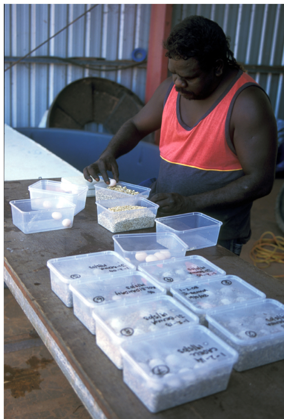
FIGURE 5 Wildlife utilization is an under-explored avenue for small-scale commercialization by Indigenous communities and importantly, for engaging Indigenous youth in culturally meaningful activities that take them on to traditional lands and increase interaction with traditional owners. Shown here are preparations for the incubation of the eggs of the northern snake-neck turtle, Chelodina rugosa . Photo: Arthur Georges, Maningrida.