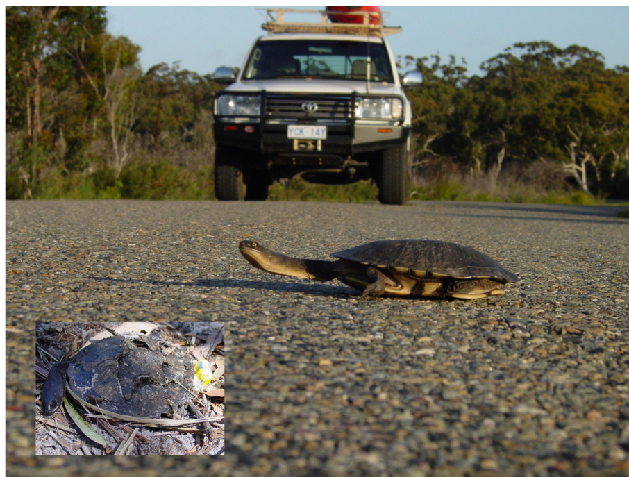
FIGURE 3 Road kill can be a substantial source of mortality for species that split activity between terrestrial and aquatic environments, as does the eastern long-necked turtle Chelodina longicollis . Much goes unreported when turtles wander off the road to later die, or when scavengers remove carcasses. Road underpasses, coupled with judicious placement of fencing, can reduce the impact in high-mortality areas.

Structural habitat simplification that often accompanies urbanization and agricultural development reduces opportunity for aestivation – when this occurs, Chelodina longicollis tends to move more directly between permanent and ephemeral waters (Rees et al., 2009; Roe et al., 2011). Roads are a major cause of adult mortality in some areas (Figure 3, Santori et al., 2018) and have been attributed to differences in survivorship between populations in proximity to urbanization and those in nature reserves (Ferronato et al., 2016, 2017). Given that the regional carrying capacity of this species depends integrally on its ability to move across the landscape, impediments to this movement can have serious consequences. Fencing for pest control in agricultural areas and even conservation fencing (Ferronato et al., 2014) can be a substantial cause of direct mortality (dead turtles stacked against the fence in corners of paddocks were reported anecdotally after installation of rabbit-proof net fencing) but more insidiously, it can restrict turtle movements between permanent refugia and the ephemeral waters that are essential for population growth and maintenance of Chelodina longicollis (Kennett & Georges, 1995). Increasing fire frequency is a concern elsewhere where fires occur during dry periods when turtles are aestivating in leaf litter and other debris (Cann, 1998, p. 26; Roe & Bayles, 2021), but has not yet been well documented in an Australian context. There are