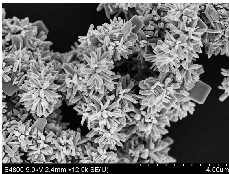
Figure S3 FE-SEM images of as-prepared ZnO samples synthesized without EA under the \text{Zn}^{2+}/\text{NaOH} molar ratios 1:12