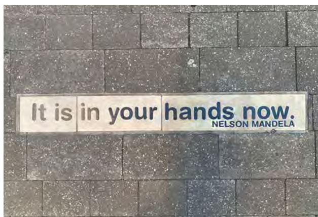
Floorscape detail, Sandton