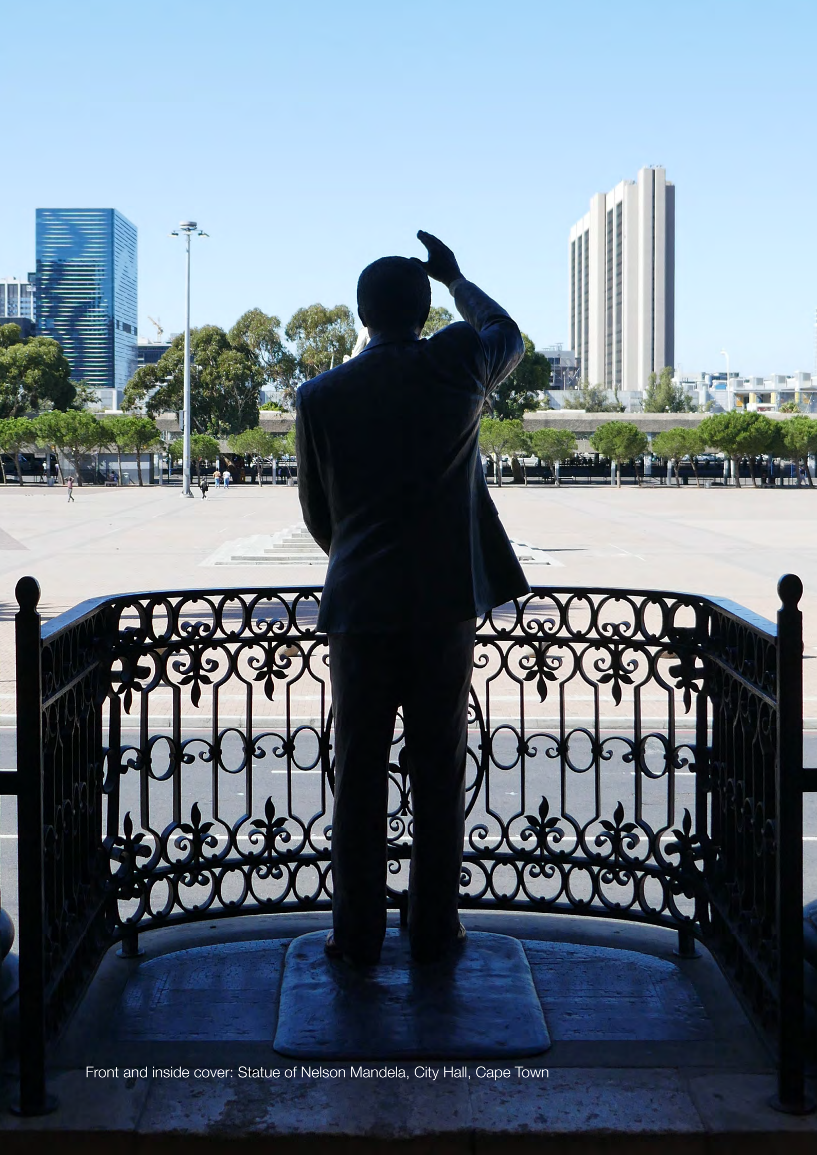
Front and inside cover: Statue of Nelson Mandela, City Hall, Cape Town