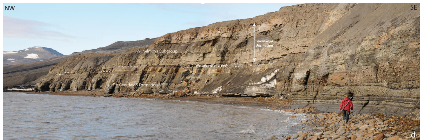
(d) The paralic upper Triassic De Geerdalen is followed by the Norian to Bathonian Wilhelmøya Subgroup. This is a highly condensed succession on Spitsbergen, with numerous hiatuses, notably missing Rhaetian to Sinemurian. The late Aalenian and Bajocian is time equivalent to the, so far, the most prolific main reservoir unit in south western Barents Sea; The Realgrunnen Subgroup. The fine to medium grained sandstones are often well sorted and classify as quartz arenites to sub arkosic arenites on Spitsbergen. Sea cliff below Myklegardfjellet.