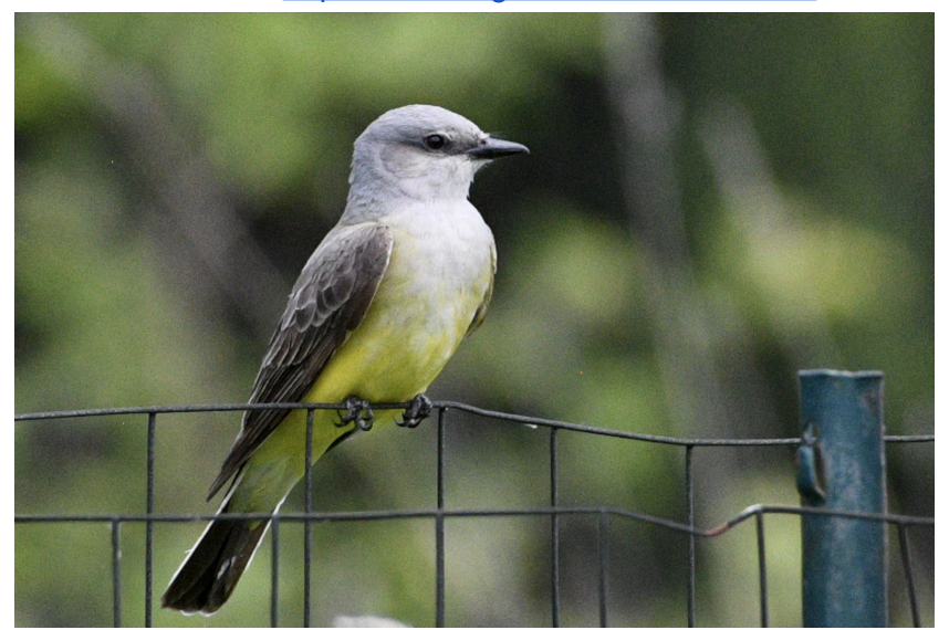
Vermont's third Western Kingbird.