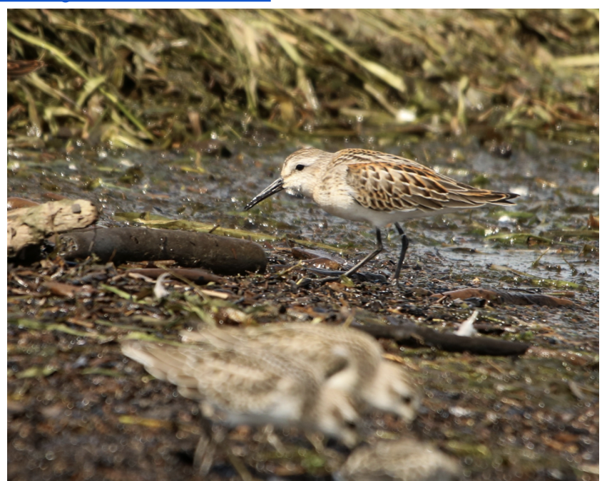
Vermont's ninth Western Sandpiper