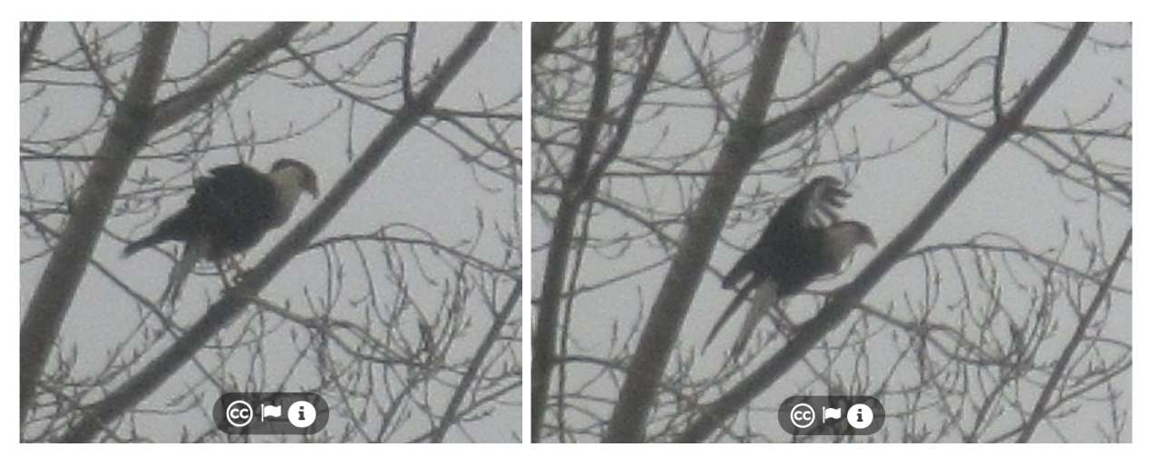
Two of a handful of images posted to the Vermont Atlas of Life on iNaturalist of Vermont's first Crested Caracara (Caracara cheriway)