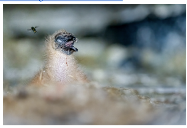
Vermont's first Black Vulture chick