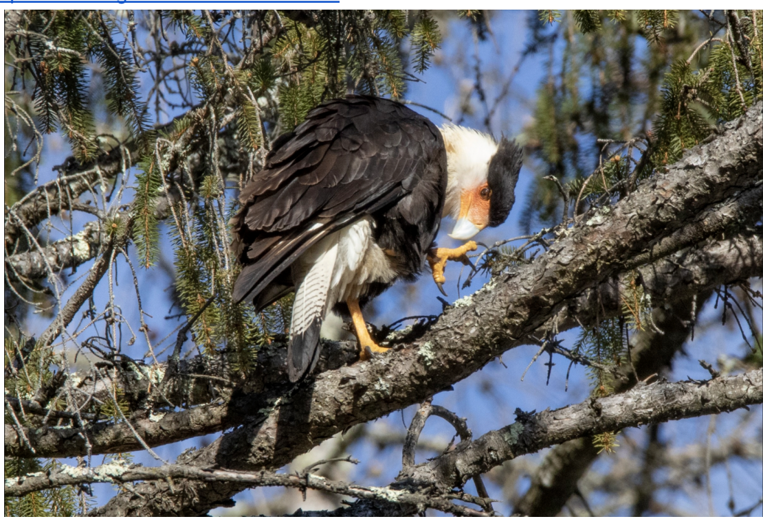
Vermont's second Crested Caracara in Woodstock, VT.