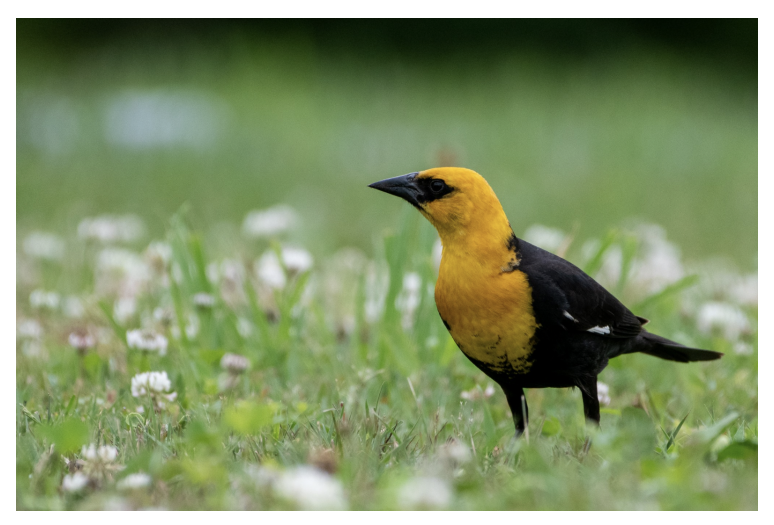
Vermont's tenth Yellow-headed Blackbird