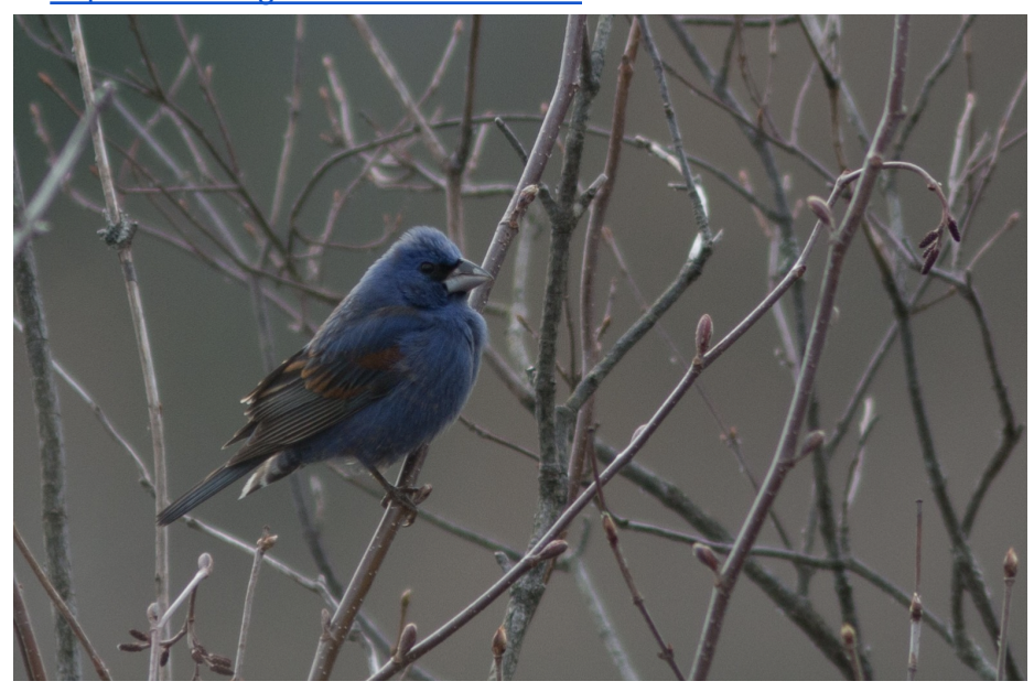
Vermont's ninth Blue Grosbeak