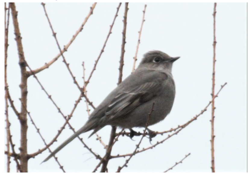
Vermont's eighth Townsend's Solitaire