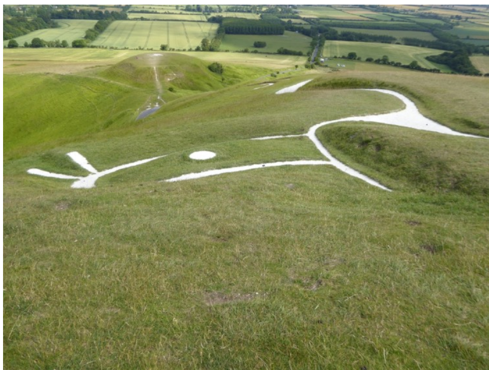
Uffington White Horse and Dragon Hill, Oxfordshire, England