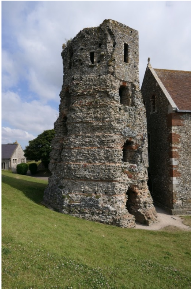
Dover Roman Lighthouse, Kent, England