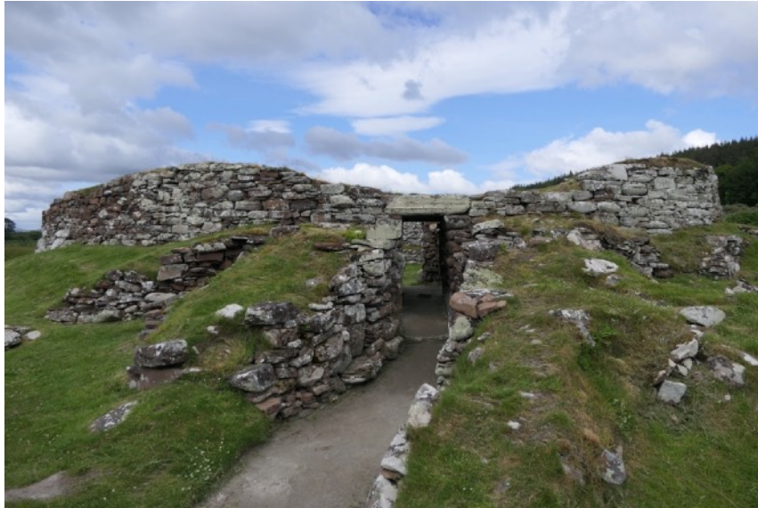
Carn Liath broch, Highland Scotland