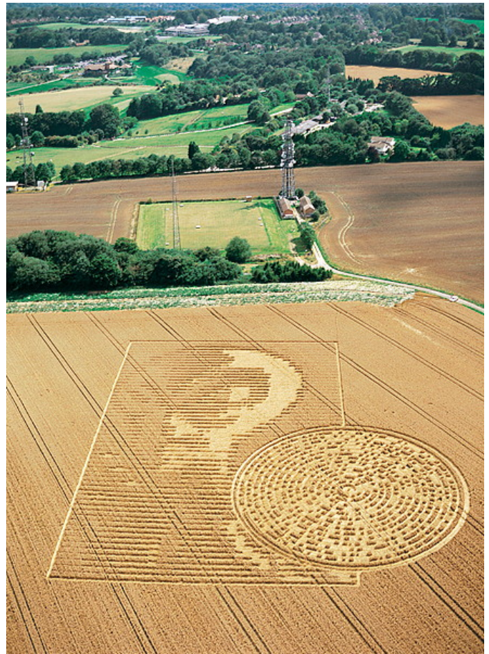
Figure 3 "Alien" with a CD disk.

In August 2019 an image appeared in the UK wheat field possibly related to the new SARS-CoV-2 virus. Picture developed only after the field was mowed and consisted of green wheat stalks that stood out on a common yellow field. Obviously, such a pattern could not be created by people. Video published on youtube.com by Stonehenge Drones escapes excludes any possibility of fake. The figure depicts a stylized image of a "gray" alien in a kind of "crown", which can also be compared with a helmet. An alien is placed in a double ring. All together can resemble a stylized image of a coronavirus. "Gray" alien also appears on one of the Chilbolton drawings. There was also a CD with ASCII encoded message written in English: "Beware the bearers of FALSE gifts & their BROKEN PROMISES. Much PAIN but still time. EELRIJUE. There is GOOD out there. We OPpose DECEPTION. Conduit CLOSING [bell sound]" The message contains links to the famous Pink Floyd disc "A Momentary Lapse of Reason". So, the phrase "BROKEN PROMISES" can be associated with the composition "Sorrow", and the album cover correlates well with the coronavirus pandemic. I wonder what the group wanted to say, depicting a river composed of hospital beds? A lonely man sits on a bed of stripped-down square image of an album. The full image is rectangular and in the hidden part of the full picture, there is a second person — a nurse with set of bed