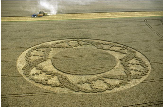
Figure 2 Unconventional RNA geometry.

same time, HIV++ could learn to fly like an regular flu. Together with its own genetic information, piece of autonomous immune system database could also be picked up. Intelligent design should imply exactly this.