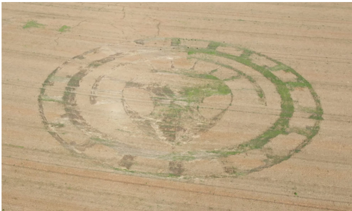
Figure 1 "Gray" alien in a crown. August 2019.

In the article "HIV++ immune upgrade virus. The hypothesis of existence." I described as a hypothetical HIV++ virus, morphologically resembling ordinary HIV, able to significantly improve human immunity. I also suggested that Chilbolton drawings in the fields of 2000-2002 were a kind of new virus properties description. Such a virus should create an independent autonomous immune subsystem within the human body, which is highly sensitive to any pathogenic antigens and is able to easily identify and eliminate such diseases as cancer, tuberculosis or AIDS.