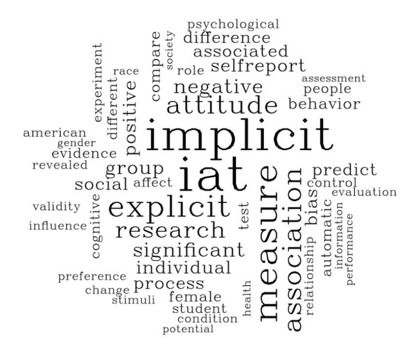
Figure 1: Abstracts word-cloud. The bigger the word font, the higher the frequency of the word. Overall, the macro-area "Social psychology" registered the highest frequency, immediately followed by the macro-area "Other".

Macro-areas Clinical and dynamic psychology and Addiction also show a rather high frequency, while macro-areas Food and Marketing show the lowest frequency, with the latter one having the least frequency of all macro-areas.