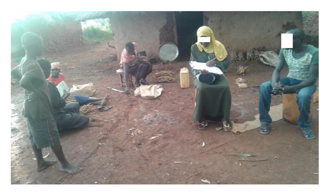
Fig. 1. Administration of questionnaires in Syanyonja village

amalgamation and losses due to adsorption onto pan walls are negligible. The procedure was repeated using different masses (2, 3, 4, 5 and 6 g) of mercury which are typical of the quantities of mercury used for amalgamation at different ASGM sites in Syanyonja village.