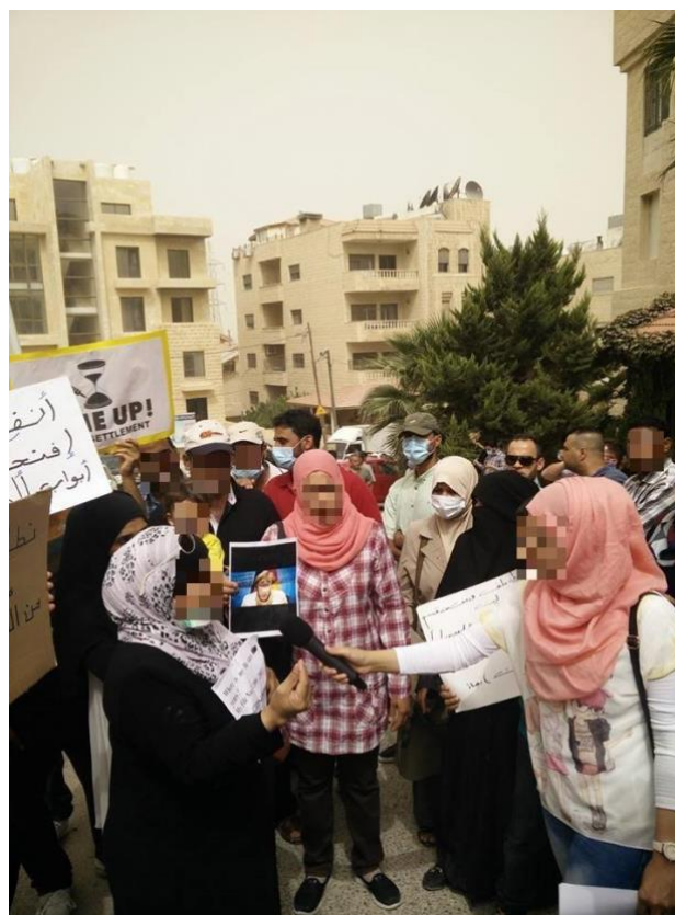
Figure 5.4. Protesting at UNHCR