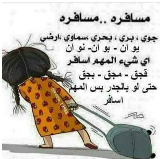
Figure 5.5. I travel... I travel