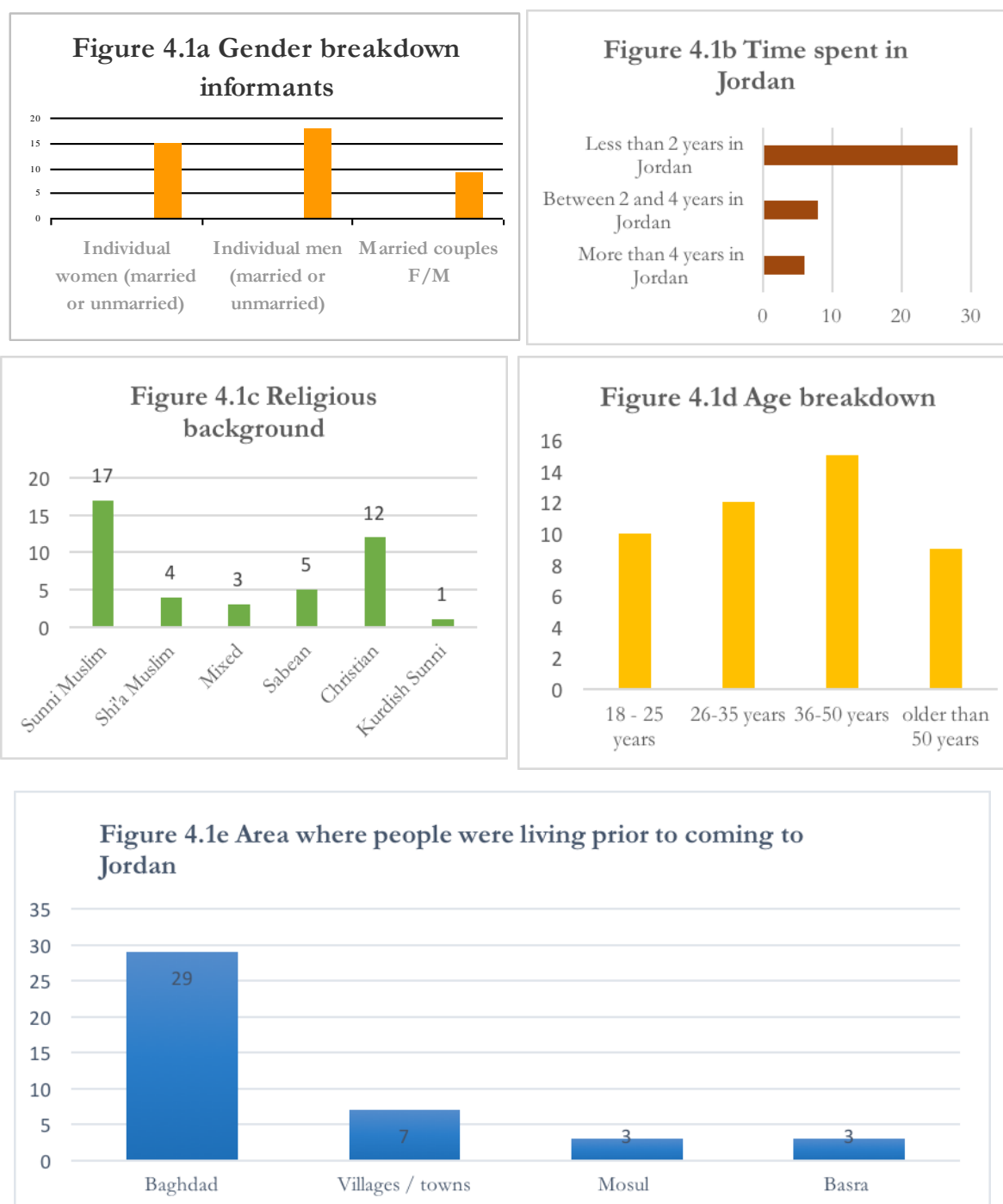
Figure 4.1. Breakdown of the characteristics of the participants

Moreover, one's social class does not necessarily move along with transnational migration. Especially in conditions of prolonged conditions of displacement people often experience down-ward social mobility (Doná, 2015; Pascucci, 2011). This means that estimating one's classed disposition is not only more guess work but also provides more of a hint to the past than to the present. However, one's class background might play a role in what expectations people have of life.