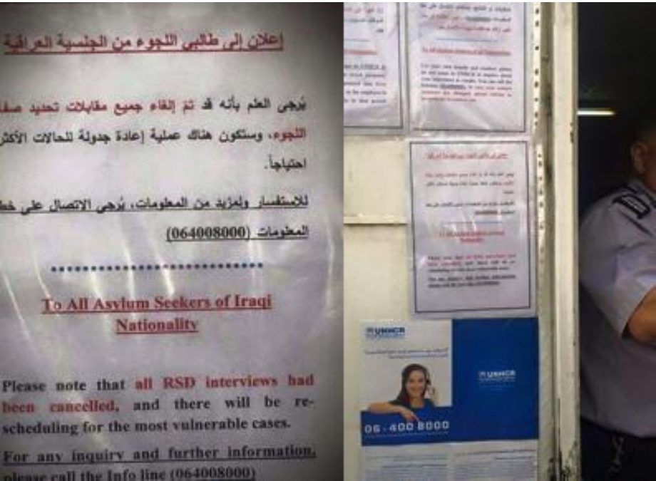
Figure 5.3. Altered UNHCR Jordan policy for Iraqi Nationals