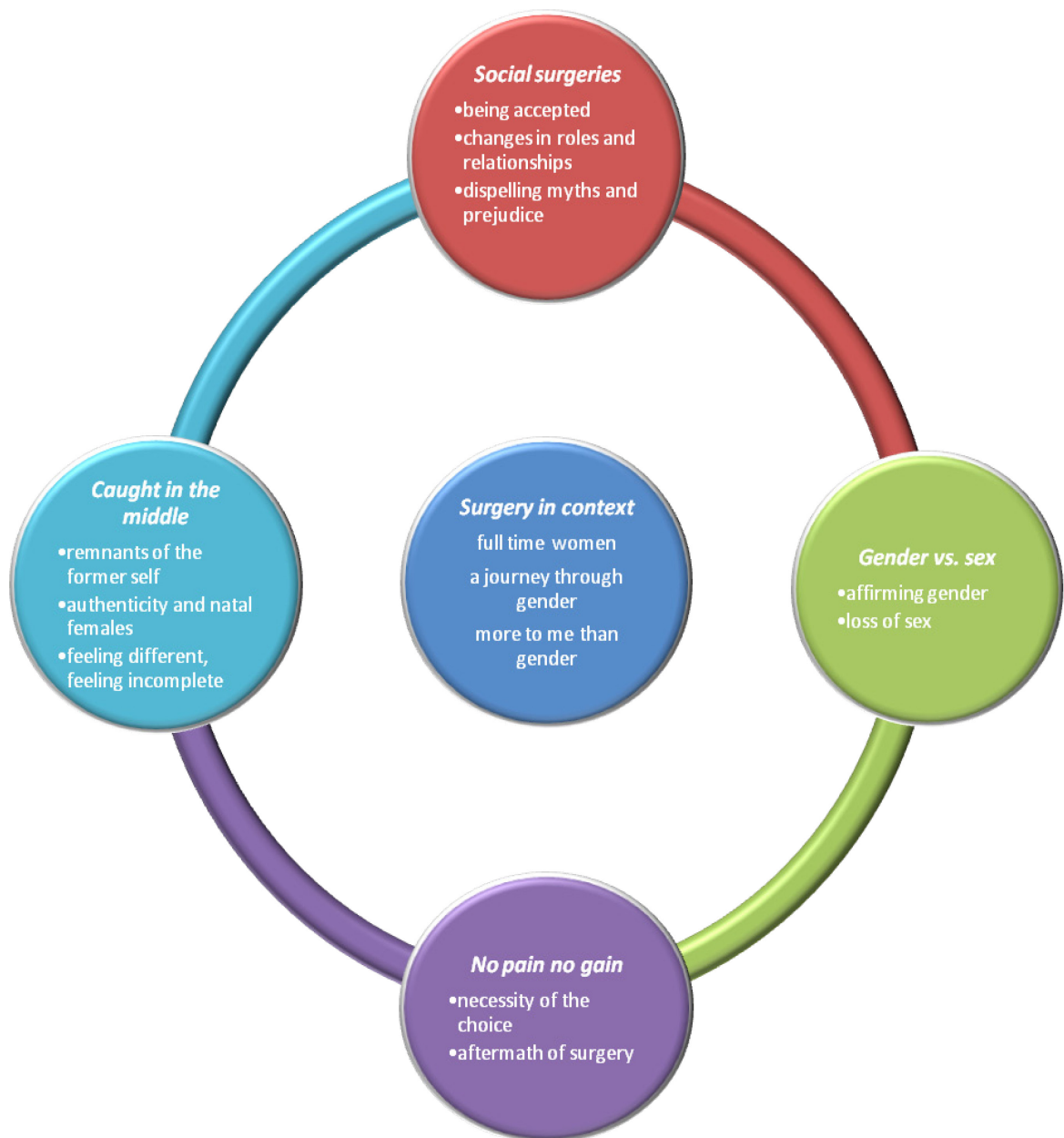
Figure 1: Representation of super- and sub-ordinate themes