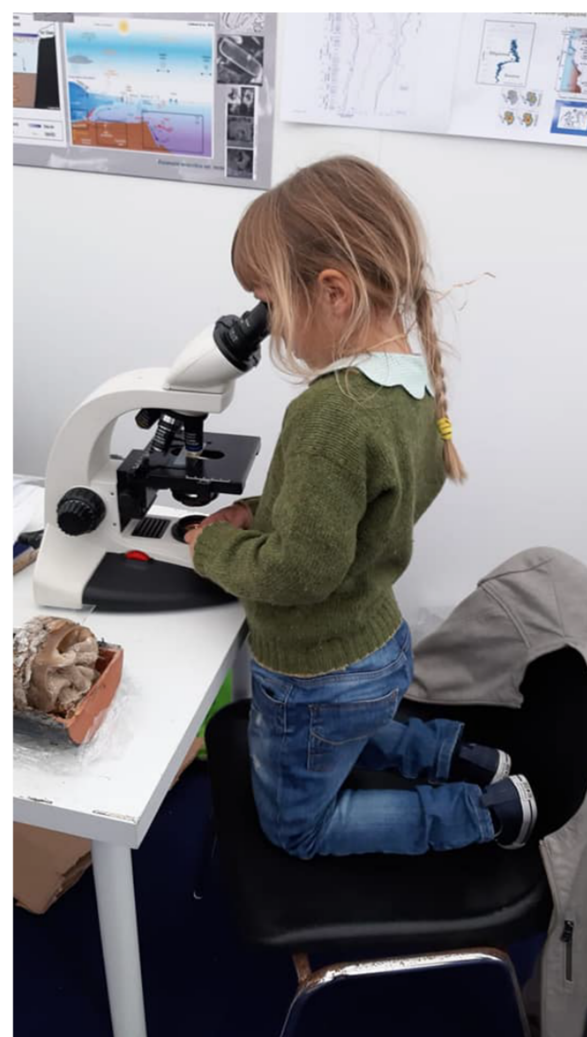
"Festival del Mare" (Genova, May 16th-18th 2019). A young researcher exploring samples from the the seafloor.

Italy officially joined the drilling program ODP in 1986 and then became a member country of the European Consortium for Ocean Research Drilling (ECORD), since its foundation in 2003.