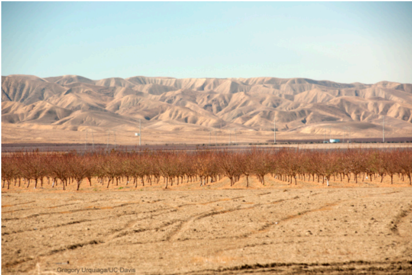
Gregory Urquiaga/UC Davis

ideal elements to consider in a synthesis in a book chapter