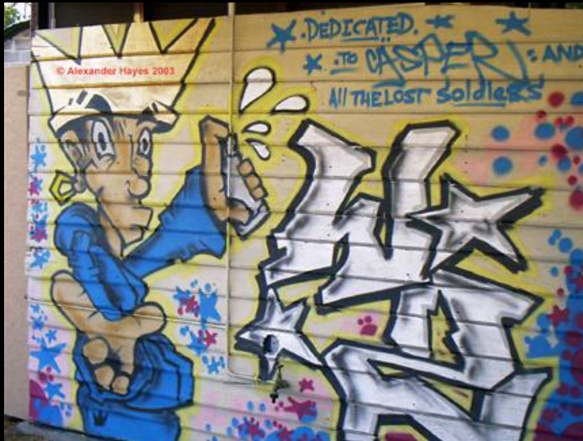
VICTORIA PARK ARTS CENTRE 'SCERT PROJECT 2003 – WZ.ONE SG ATS