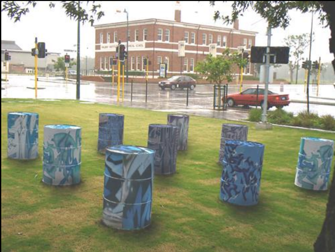
PROPOSED PUBLIC SCULPTURE FOR MIDLAND CULTURAL PRECINCT - 2