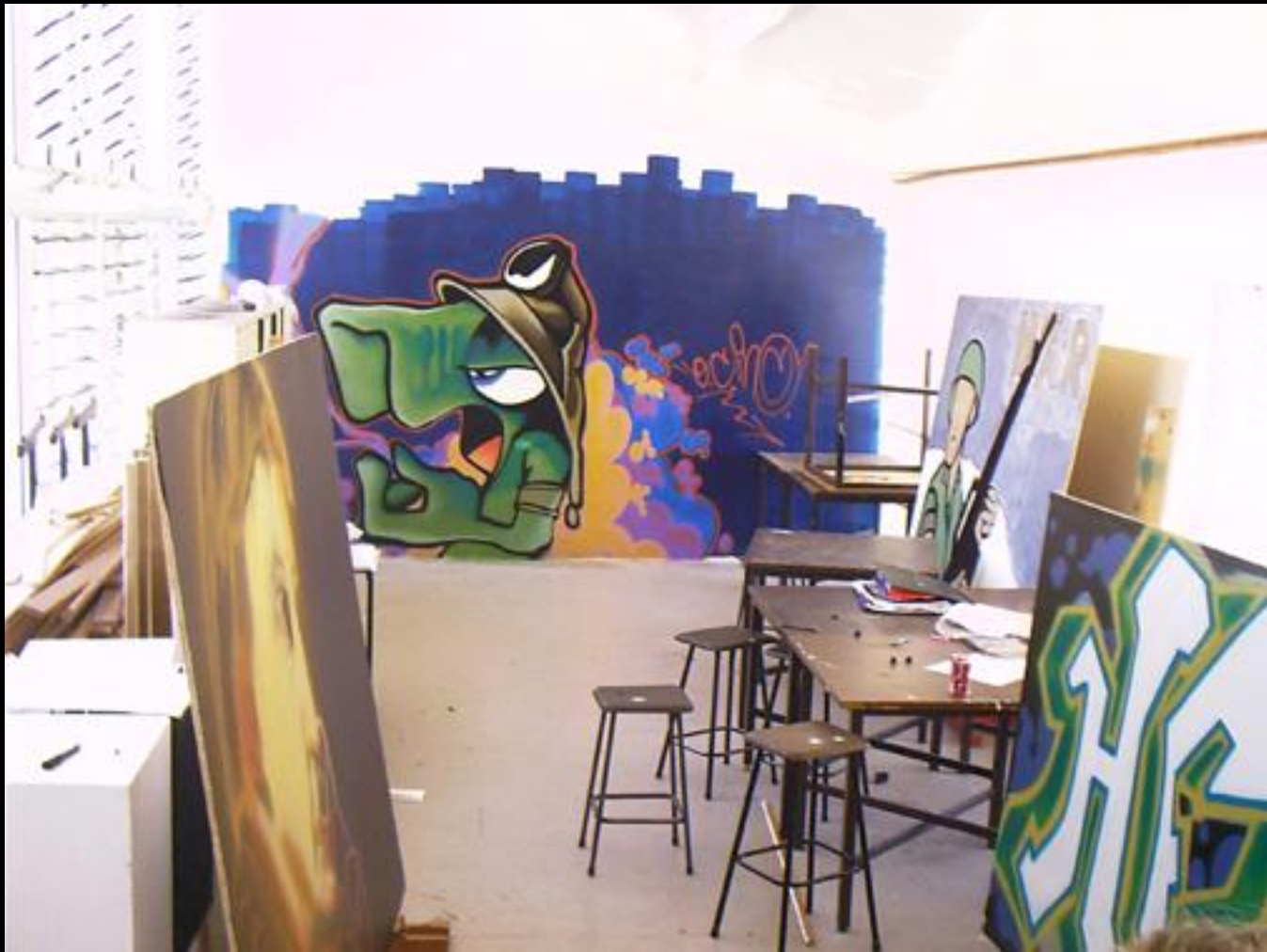
Guildford Grammar Public Art Project 2003