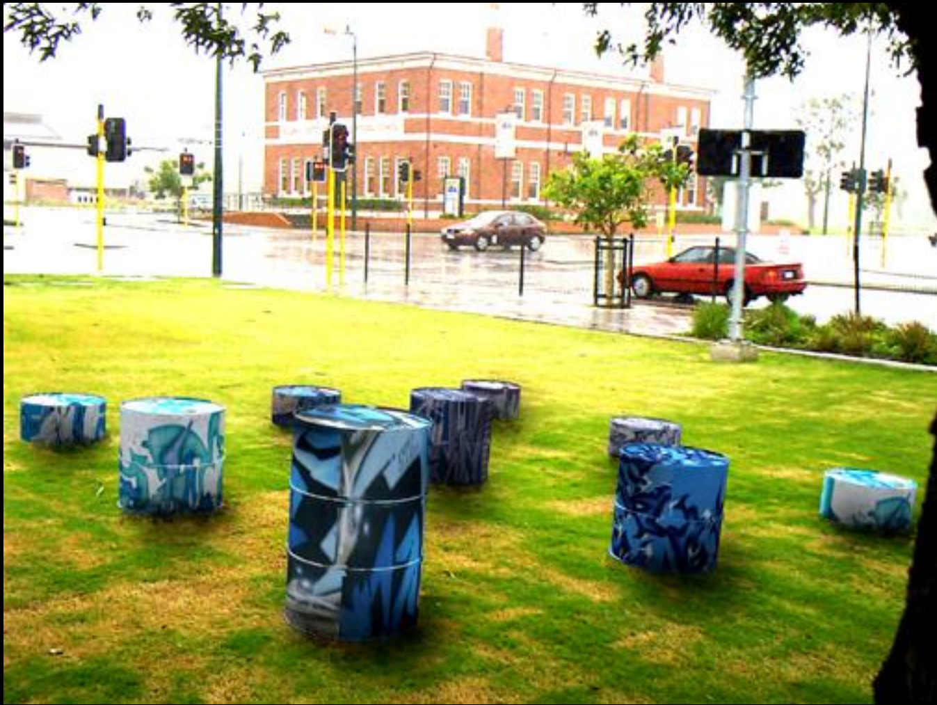
PROPOSED PUBLIC SCULPTURE FOR MIDLAND CULTURAL PRECINCT - 1