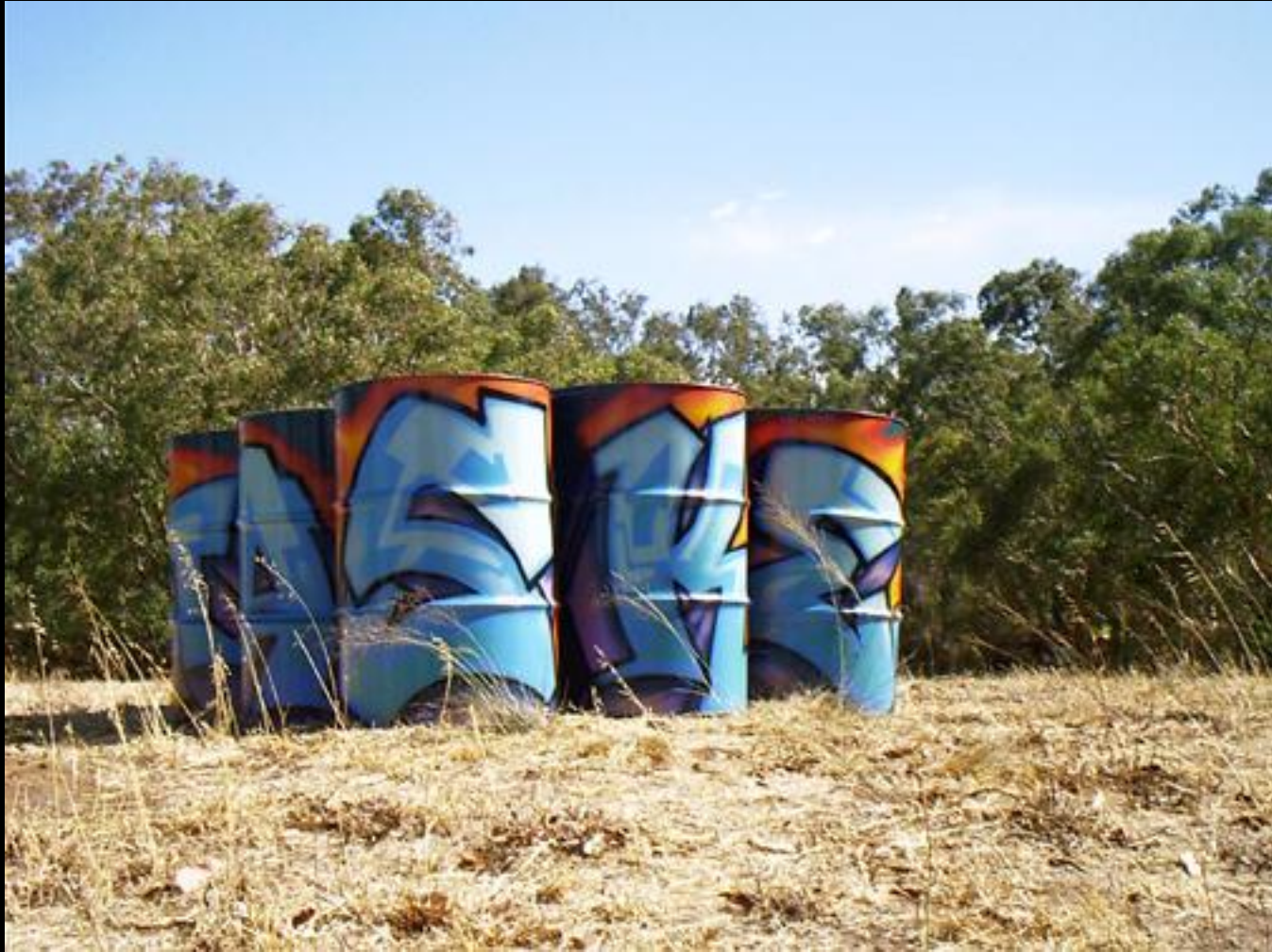
TASK OC AT GOMBOC SCULPTURE SURVEY 2003