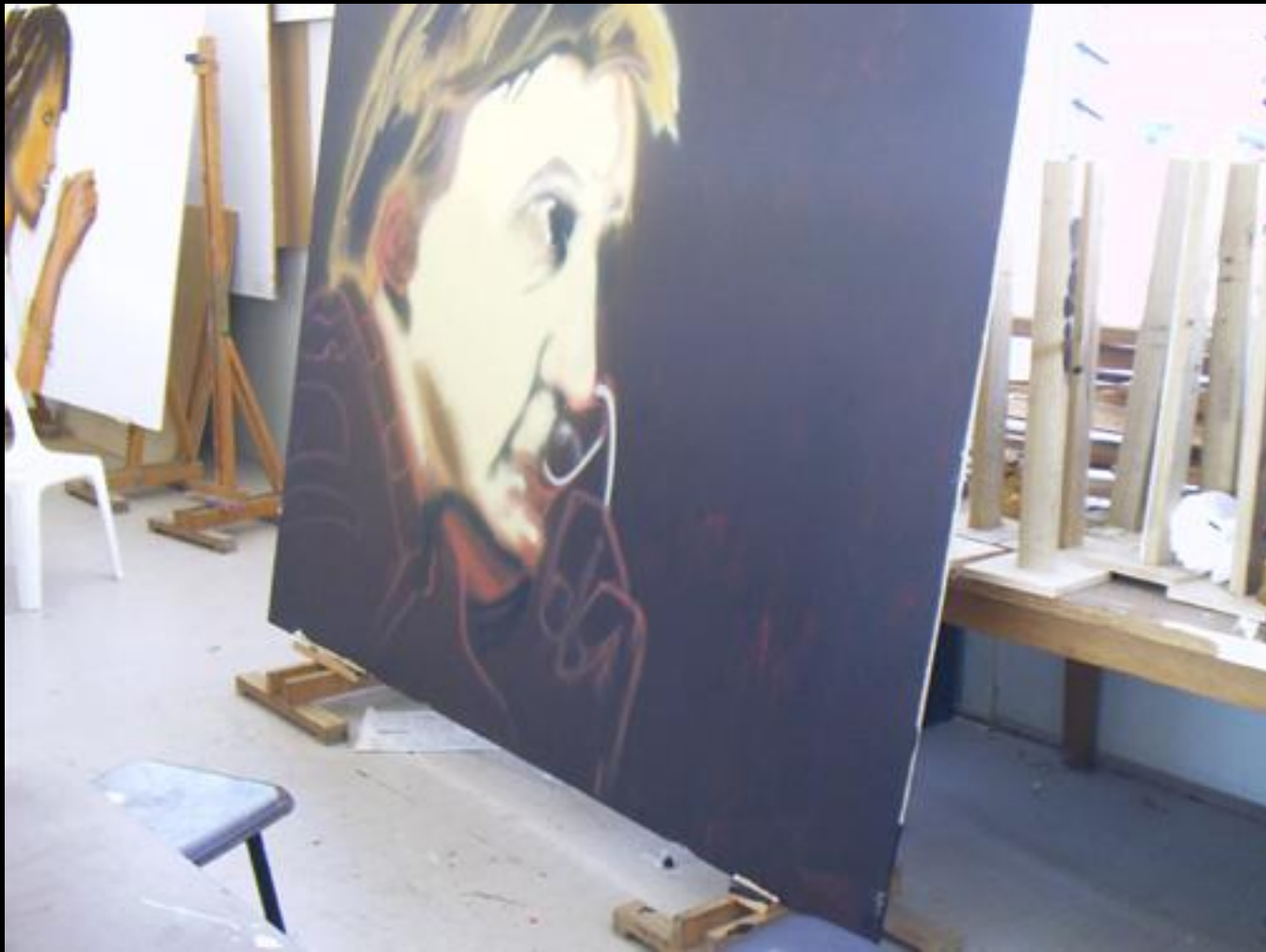
Guildford Grammar Public Art Project 2003