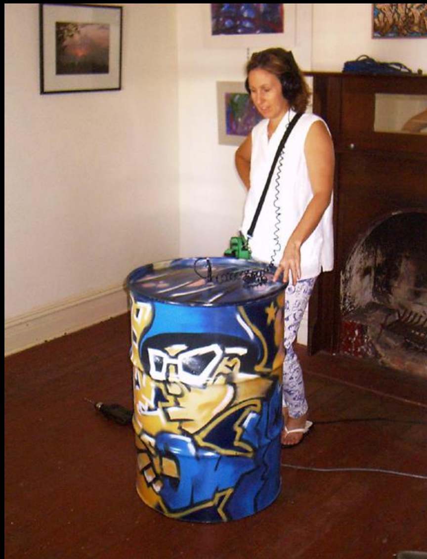
VICTORIA PARK ARTS CENTRE 'SCERT PROJECT 2003 – WZ.ONE SG ATS