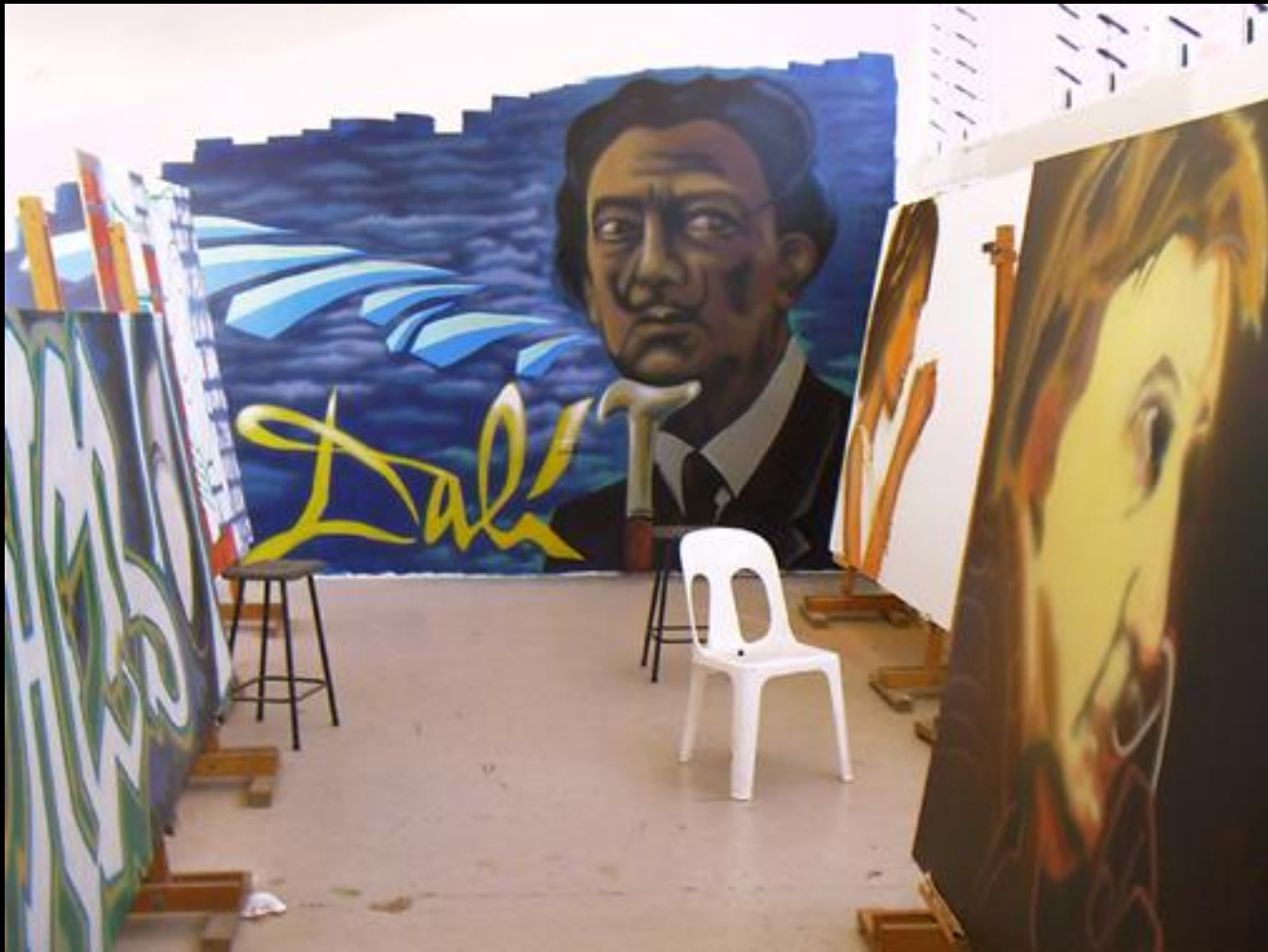
Guildford Grammar Public Art Project 2003