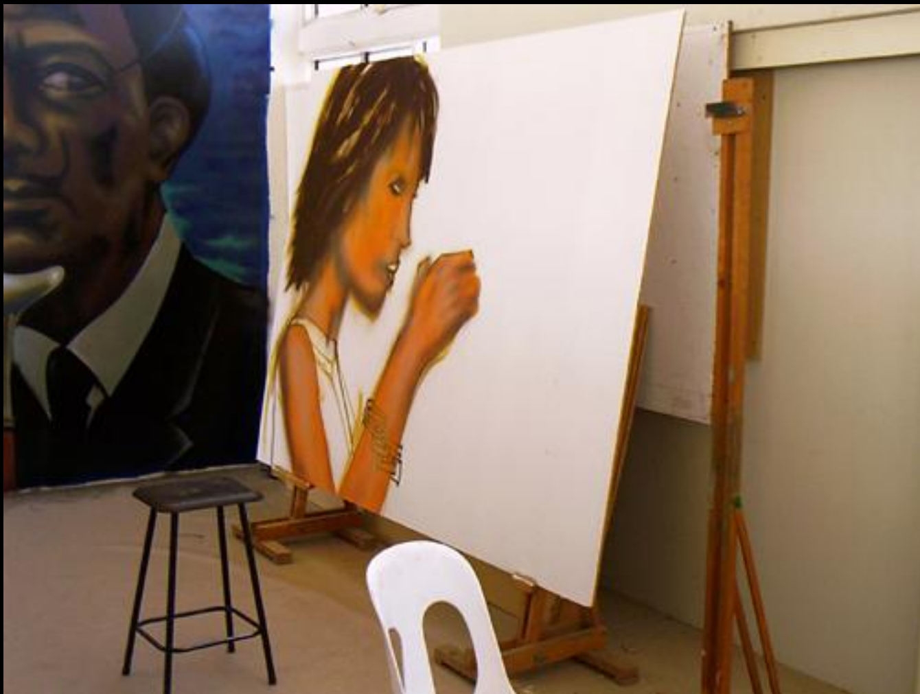
Guildford Grammar Public Art Project 2003