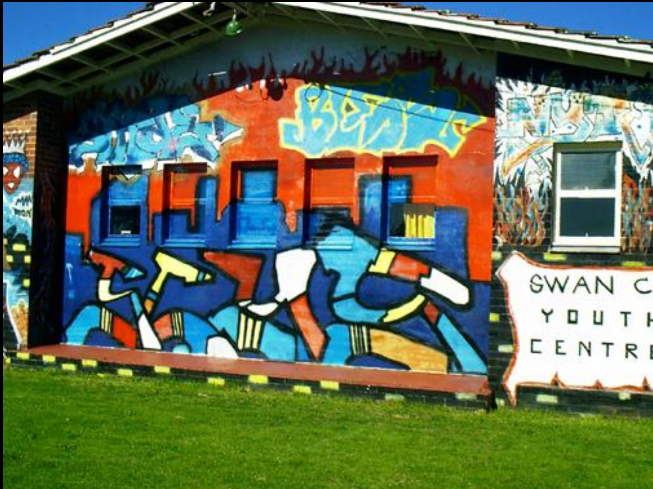
SWAN CITY YOUTH SERVICES