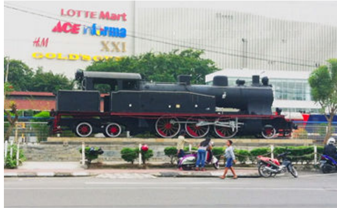
Figure 3. Dutch era Locomotive Monument in Medan Merdeka Square

Another point of interest is the monument of Medan zero kilometer in front of heritage buildings Kantor Pos Medan . With the background of the legendary Hotel De Boer (Figure 4) then this area becomes crowded node where even now has become a community gathering points of bicycles and pedestrians. Rating if the desire to stay at the heritage hotel Hotel De Boer is the right choice. A little to the left will be neatly lined colonial buildings that Bank Indonesia building and the Balai Kota has been conserved adaptive re-use becomes Aston Hotel .