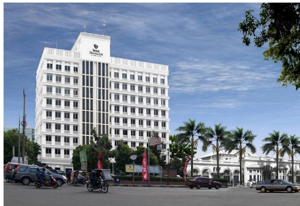
Figure 4. Hotel De Boer (now Inna Hotel) in Medan Merdeka Square

Another point of interest is the monument of Medan zero kilometer in front of heritage buildings Kantor Pos Medan . With the background of the legendary Hotel De Boer (Figure 4) then this area becomes crowded node where even now has become a community gathering points of bicycles and pedestrians. Rating if the desire to stay at the heritage hotel Hotel De Boer is the right choice. A little to the left will be neatly lined colonial buildings that Bank Indonesia building and the Balai Kota has been conserved adaptive re-use becomes Aston Hotel .