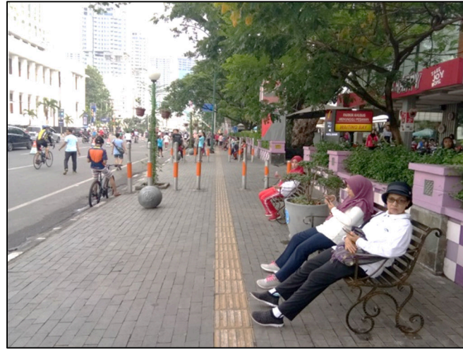
Figure 7. Potential Gateway District facilities in Medan Merdeka Square

Merdeka Square neighborhood linkage will be formed with the ease of access to important nodal of railway station, Lonsum building, Bank Mandiri building, Balai Kota , Hotel De Boer (now Inna Medan ), Kantor Pos building, Kesawan heritage district and Pajak Ikan Lama trade center. Movement of tourists visit can be done with local transport model uses a motor rickshaw decorated with typical of the city of Medan. The movement of productive economic activities in the area of Merdeka Square is consistent with the concept that combines street and square along with interesting activities in the locality strengthen local identity.