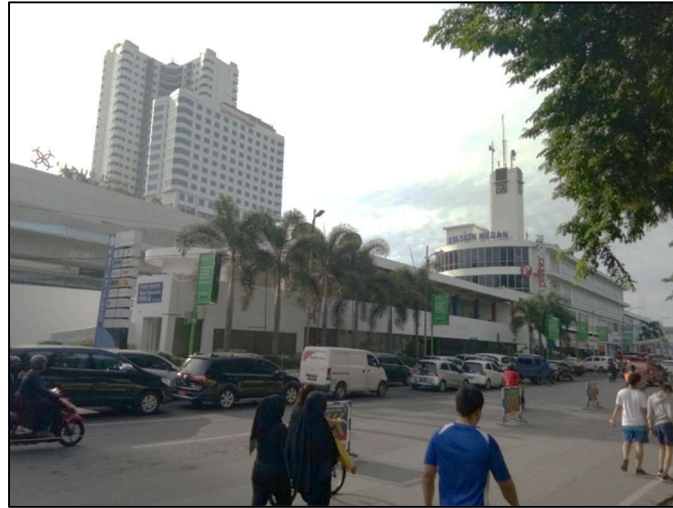
Figure 5. Potential Gateway District around railways station in Medan Merdeka Square