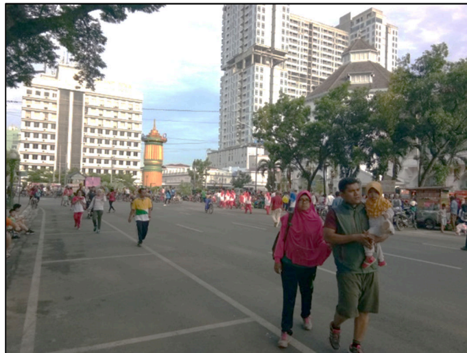
Figure 6. Potential Gateway District activities in Medan Merdeka Square

Provision of facilities for public street furniture such as seats (Figure 7) and decorative lighting city room accommodates enjoyment activities with visual treat towards the historical buildings, under the shade of a big tamarind tree, street musicians show with thematic exhibitions and special snacks treats the city of Medan. This city open space can be used also for the activities of the souvenir center that will strengthen memories the city of Medan.