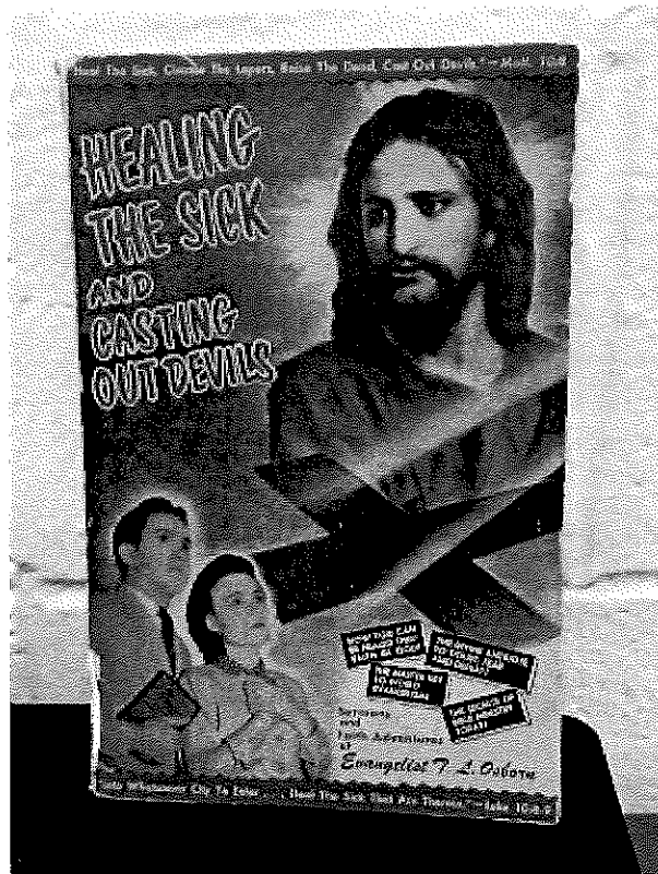
Healing the Sick and Casting Out Devils (The Voice of Faith Ministry, 1955)

The 1955 edition of T.L. Osborn's Healing the Sick and Casting Out Devils included a