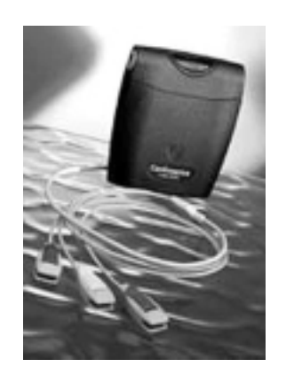
Figure 4 The CNET 2000 Millennium product