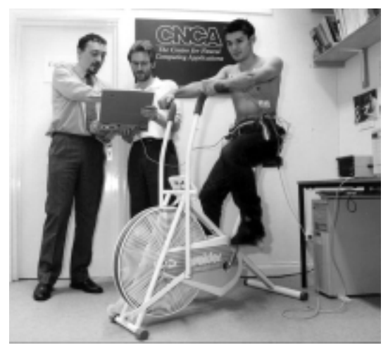
Figure 3 The heart monitor during development

within the department, and also within the research department of companies applying the technologies. In particular, Cardionetics Ltd (Cardionetics, 2000), a neural medical products developer, was founded upon a final year design project which implemented techniques taught within the AI modules. The original concept was to use ANNs to analyse heart ECG signals and detect specific abnormalities. The product was developed from monitoring infant conditions utilising PC based software, to a portable product with the AI algorithms embedded in a 32 bit ASIC hardware platform which can monitor a patient for 24hrs and identify problematic heart conditions. Its success has been acknowledged by being selected as a UK Millennium Product (Figure 3 and 4).