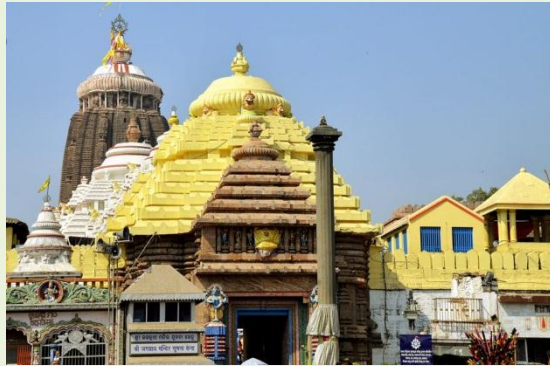
Jagannath Temple, Puri