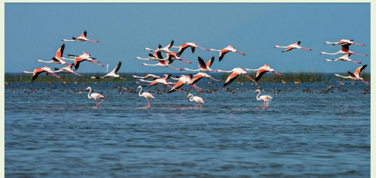
Chilika Lake, Bhubaneswar