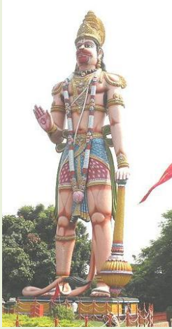
Hanuman Vatika, Rourkela

Refer attractions nearby Rourkela and Odisha at: click here | Other attractions | Near by Rourkela | Odisha