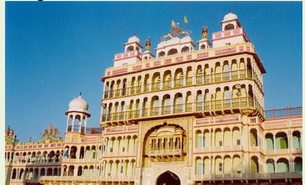
Rani Sati temple, Rourkela