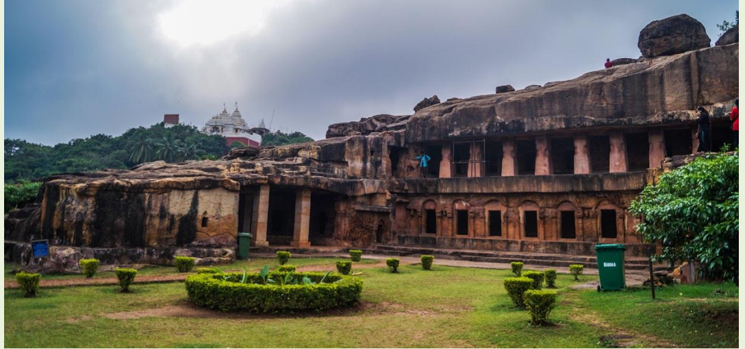
Udaygiri & Khandagiri Caves, Bhubaneswar