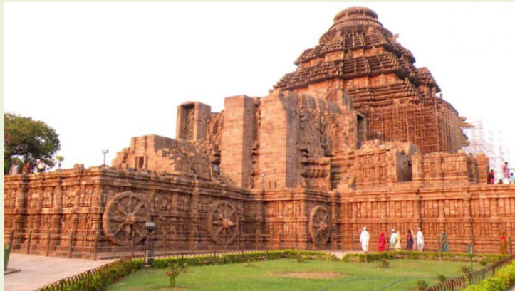
Sun Temple, Konark