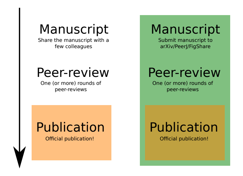
Figure 1: It can take several months before a submitted paper is officially published and citable. Meanwhile, few people are aware of the research that has been done since, typically, only close colleagues are given access to the preprints. With public preprint servers, the science is immediately available and can be openly discussed, analyzed, and integrated into current research.

The first and most often discussed advantage of open preprints is speed (Figure 1). The time between submission and the official publication of a manuscript can be measured in months, sometimes in years. For all this time, the research