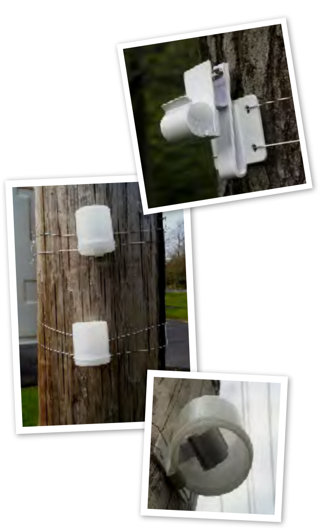
Ogawa Passive Sampler located at outdoor location in Standard Shelter, showing mounting components.

The implementation of the sampler does not require highly skilled personnel, making it feasible to establish even large air sampling networks with minimal training without the need for conventional analyzer maintenance.