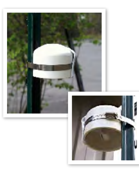
Ogawa Passive Sampler installed in Ozone Shelter.