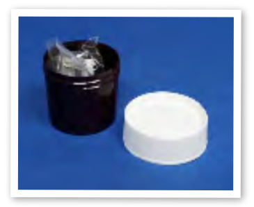
Container for Sampler in Clip, housed in plastic bag.

Following exposure, the samplers and/or pads are returned to the laboratory for analysis. A variety of containers are available, depending upon whether the sampler with clip, sampler body, or only the collection pad is to be transported.