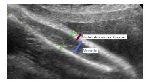
Fig1b Fetal midthigh muscle thickness and subcutaneous tissue measurements. The mid-thigh fat and muscle measurements were measured linearly at a 90 degree angle to the mid-point of the femur in the standard longitudinal plane used for FL measurement.

Fig 1a Fetal abdominal subcutaneous tissue measurement (FAST). This was measured in millimetres on the anterior abdominal wall anterior to the margins of the ribs, using magnification at the same level as the AC proximal to the cord insertion.