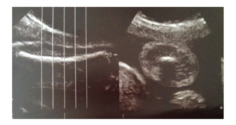
Figure 2 Fractional thigh volume (TVol) using three-dimensional ultrasound. A sonographic view of the fetal thigh is analysed at 33 weeks. Fractional limb volume measurements were manually traced around a central portion of the femur diaphysis (4D View 9.0, GE Healthcare Ultrasound).