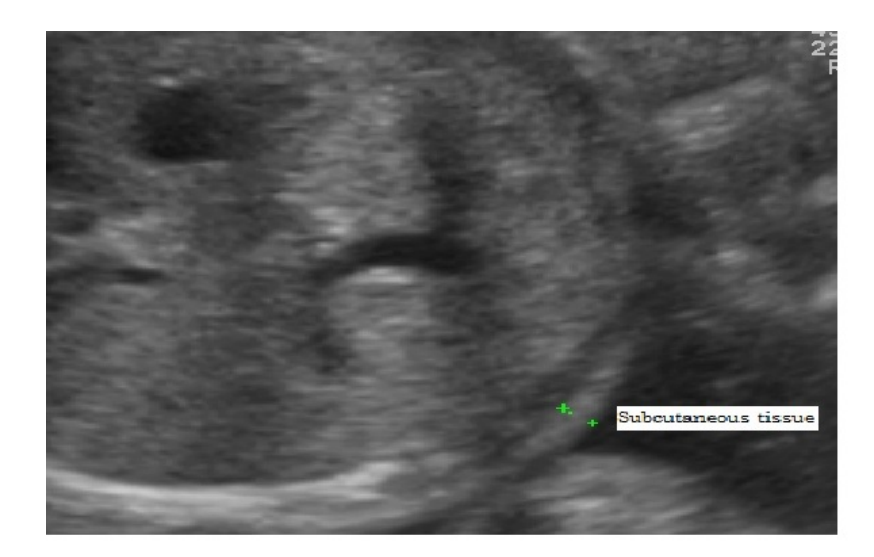
Fig 1a Fetal abdominal subcutaneous tissue measurement (FAST). This was measured in millimetres on the anterior abdominal wall anterior to the margins of the ribs, using magnification at the same level as the AC proximal to the cord insertion.