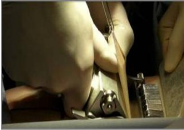
Supplemental Fig. 2: