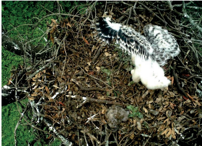
Female C3 56

Ltl Acorn 082°F 028°C 11/13/2013 15:55:21