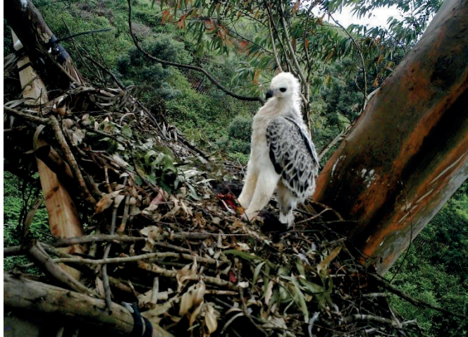
Male E4 66

Ltl Acom VCCE ○ 080°F 027°C 13/12/2012 14:48:49