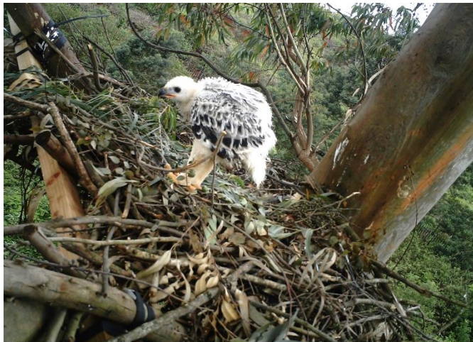
Male E4 54

Ltl Acorn VCCE 073°F 023°C 01/12/2012 11:26:55