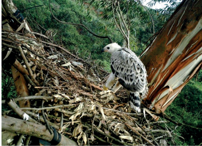
Male E4 83

Ltl Acom VCCE 082°F 028°C 30/12/2012 17:05:50