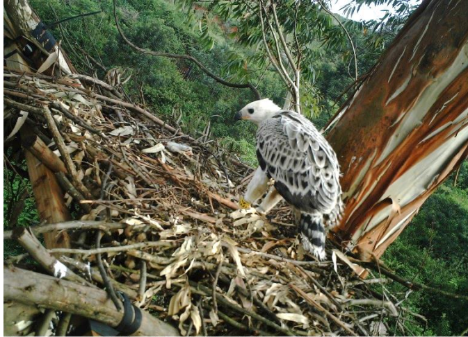
Male E4 83

Ltl Acom VCCE 082°F 028°C 30/12/2012 17:05:50