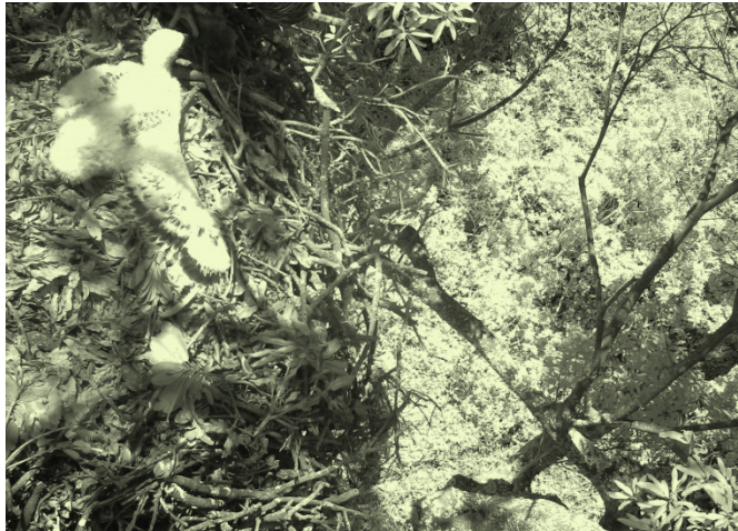
Female C3 44

Ltl Acorn 082°F 028°C 11/01/2013 13:32:21