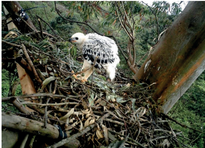
Male E4 54

Ltl Acorn VCCE 073°F 023°C 01/12/2012 11:26:55