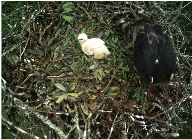
Female C3 32

Ltl Acorn ◀ 062°F 017°C 10/20/2013 08:51:29