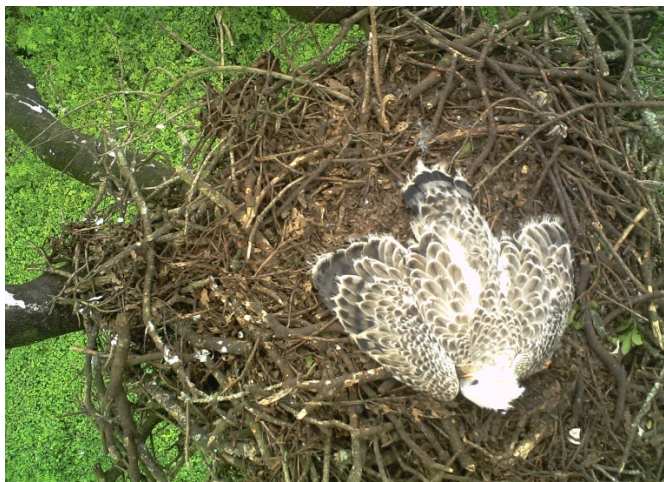
Female C3 86

Ltl Acom 078°F 026°C 12/13/2013 11:24:43