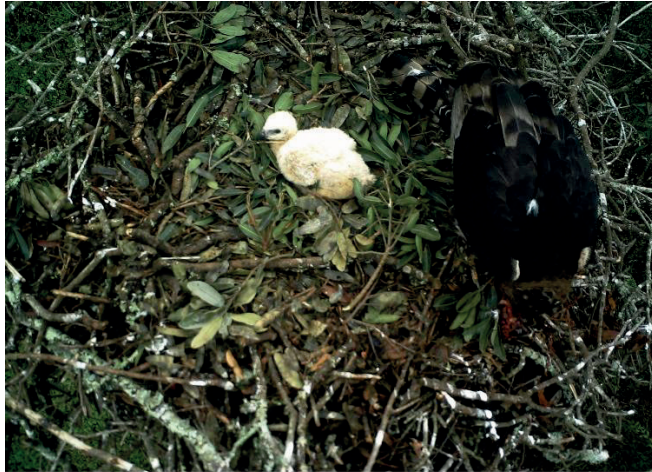
Female C3 32

Ltl Acorn ◀ 062°F 017°C 10/20/2013 08:51:29