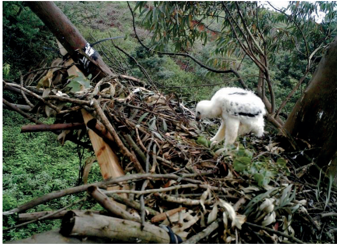
Male E4 44

Ltl Acorn VCCE 069°F 021°C 21/11/2012 13:04:31