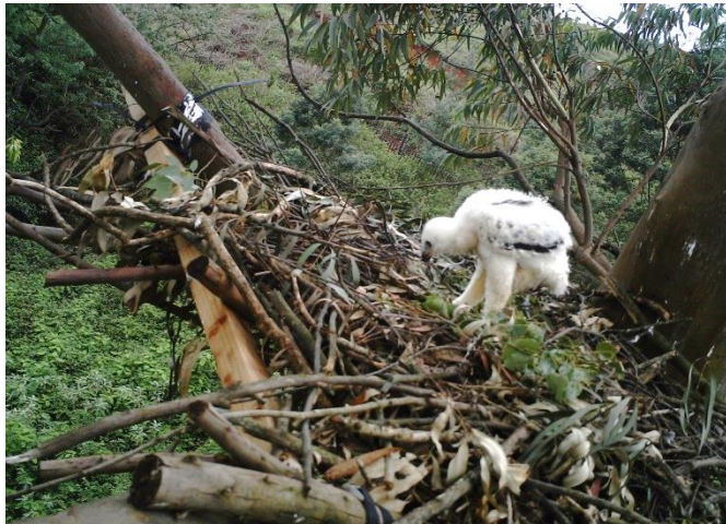
Male E4 44

Ltl Acorn VCCE 069°F 021°C 21/11/2012 13:04:31