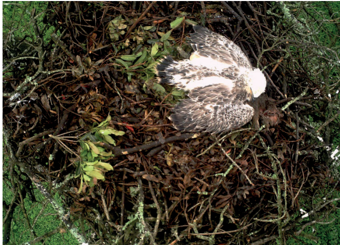
Female C3 71

Ltl Acom ◀ 060°F 016°C 11/28/2013 10:55:10