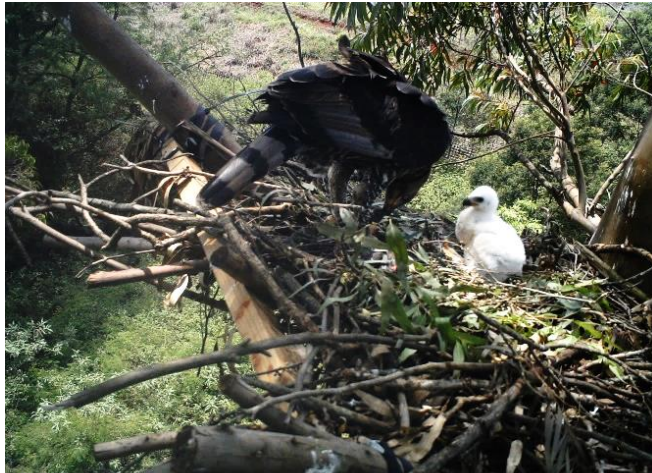
Male E4 32

Ltl Acorn VCCE ◀ 077°F 025°C 09/11/2012 11:00:32