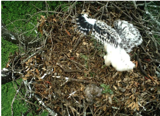
Female C3 56

Ltl Acorn 082°F 028°C 11/13/2013 15:55:21