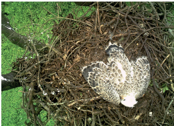
Female C3 86

Ltl Acom 078°F 026°C 12/13/2013 11:24:43