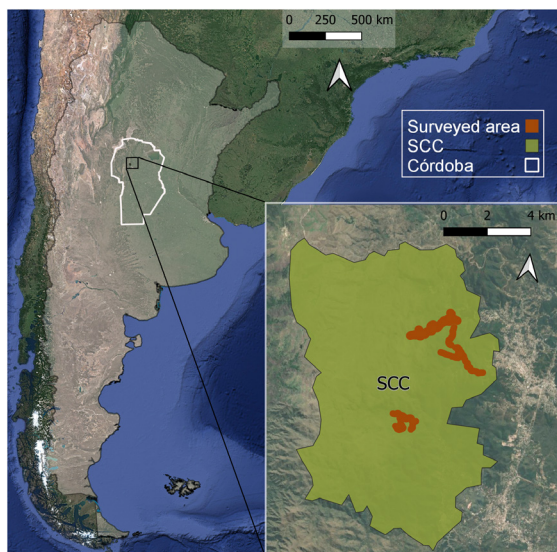
Figure 1. Map showing details of the surveyed area in central Argentina. Córdoba province is delineated in white and the Sierras Chicas Corridor (SCC) is represented as the green area inside the box. The area where owls were searched (surveyed area, ~250 ha) is indicated in dark orange.