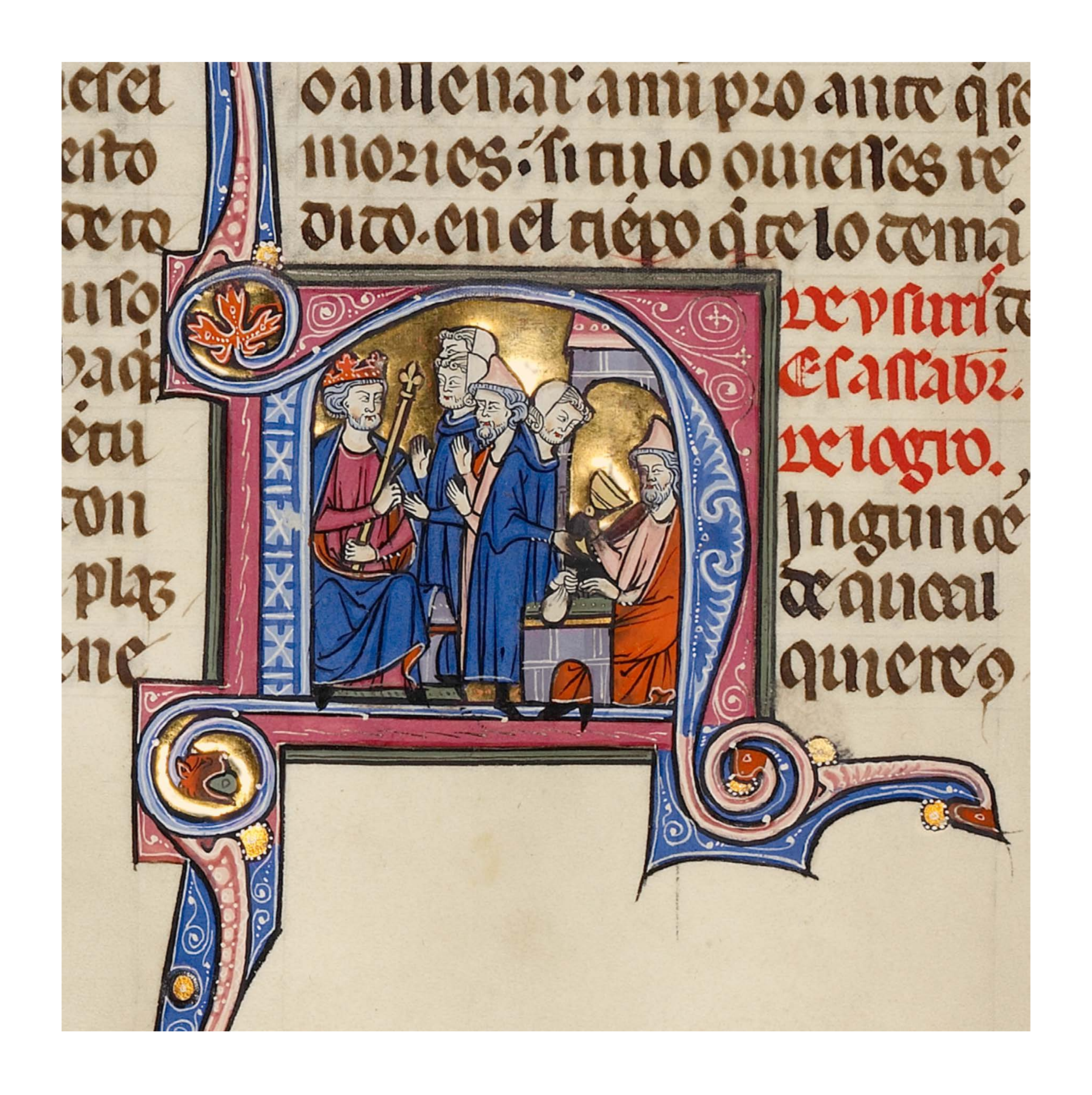
Figure 1 The Vidal Mayor, J. Paul Getty Museum, Ms. Ludwig XIV 6, 83.MQ.165., folio 175v