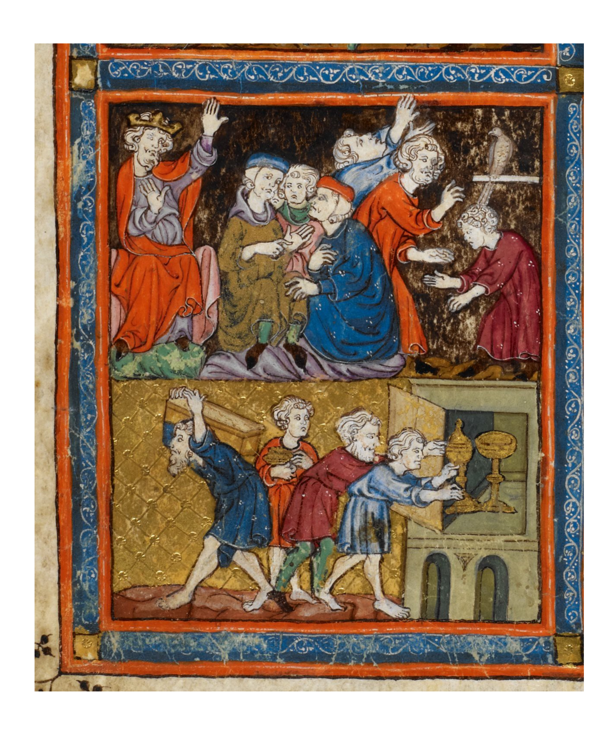
Figure 2 The Golden Haggadah, folio 13r. Bottom left: "The Spoiling of the Egyptians and the Plague of Darkness" c British Library Board, MS Add. 27210