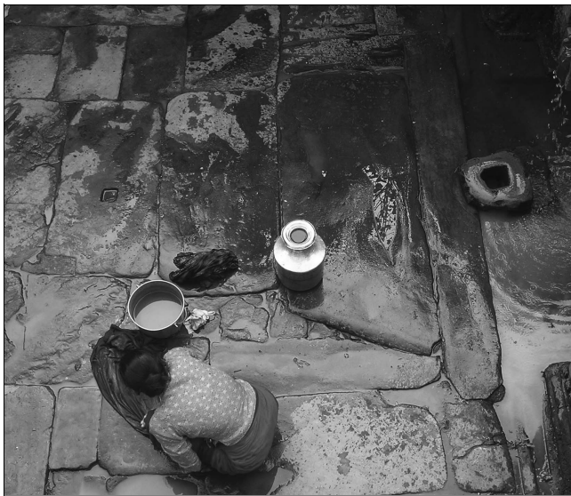
Figure 1. Woman collecting water at a well

physical or sexual assault in secluded areas. With the provision of appropriate toilets, women and girls can use them at any time, in private, without shame, embarrassment or fear. 7 This is a liberating development for women whose lives can often be dominated by this basic need.