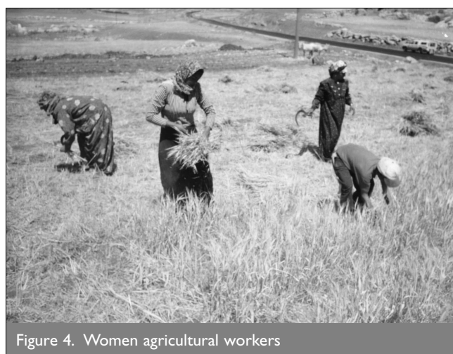
Figure 4. Women agricultural workers

Clearly, time saved in water carrying does not generally result in women being less productive. 12 Only the nature of the tasks change. However, there is evidence to suggest that quality of life may still be improved. Hoogervorst 41 demonstrates the impact of a Netherlands Development Organisation (SNV) programme in Benin, which constructs boreholes to provide safe drinking water. An evaluation noted that while women enjoyed time savings, they then increased