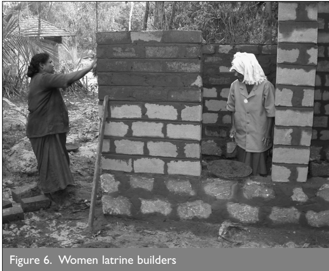
Figure 6. Women latrine builders

and their children. Nepal Water for Health 50 describe the case of a 34-year old Nepalese woman who was trained as a mason on a drinking water, hygiene education and sanitation project. Abandoned by her husband, she is the sole breadwinner for her two children and now works building latrine superstructures and foundations, installing pans and constructing slabs and rings. In spite of opposition from male masons reluctant to work alongside a woman, she is now a successful skilled mason and is able to provide for her children independently.