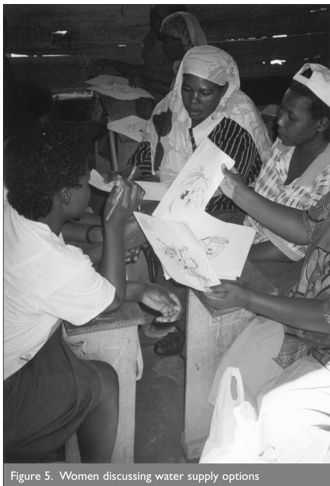
Figure 5. Women discussing water supply options

Three years ago, before we formed a committee and prepared ourselves as a community for the water source, men just saw women as animals. I think they thought of us as bats flapping around them. They had no respect and no one would allow you to speak or listen to what you had to say. When I stand up now in a group meeting I am not an animal. I am a woman with a valid opinion. We have been encouraged and trained and the whole community has learnt to understand us. I was treated like a donkey only fit to carry baggage all the time. Or a scrap of paper, just rubbish in the wind. I can assure you though, that if you come back in a few years you will see that women will be leaders of this village. That will bring so many benefits to everyone!