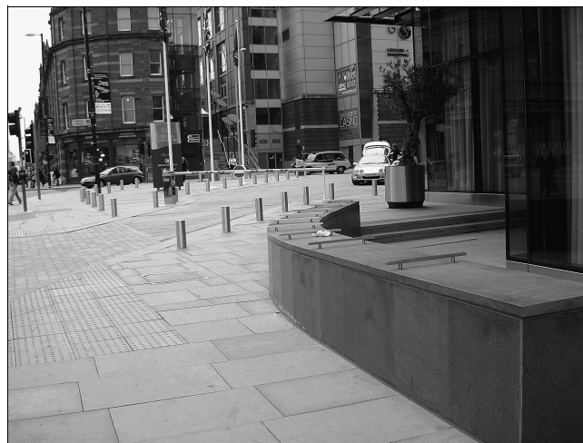
Fig. 3. The standoff area surrounding the Hilton Hotel in central Manchester

One security approach is to attempt to 'design out' or mitigate the effects of terrorism by creating an environment that is inherently less likely to suffer attack or can minimise consequences and impact—one in which primary security resources such as the police can operate without hindrance by building layout or one in which public participation in counter-terrorism through general vigilance is enhanced. Similar approaches have been used successfully to design out crime in residential environments 20 and transport infrastructure. 21 A considerable body of work already exists on environmental design for crime prevention where a sense of community safety can be fostered by enhancing defensible space, natural surveillance and community